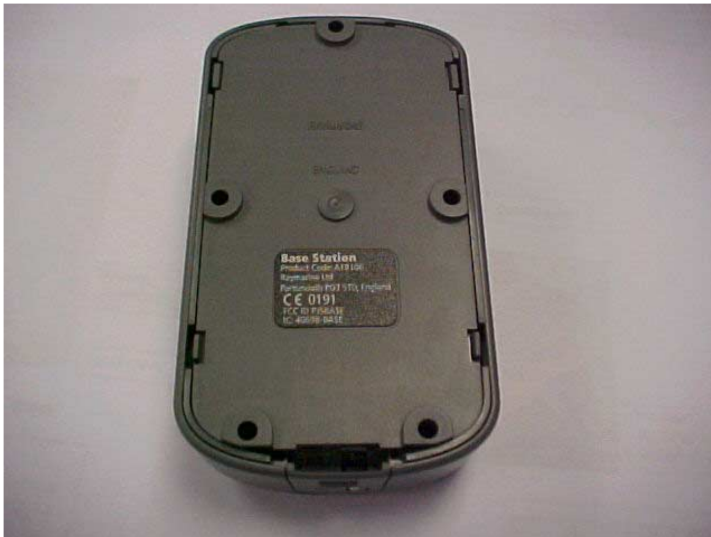
Base Station: FCC and IC Label location