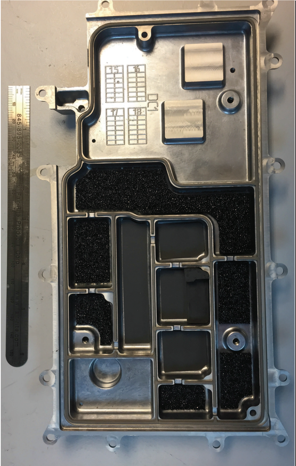
Figure 9 -- RF PCB Cover - Top