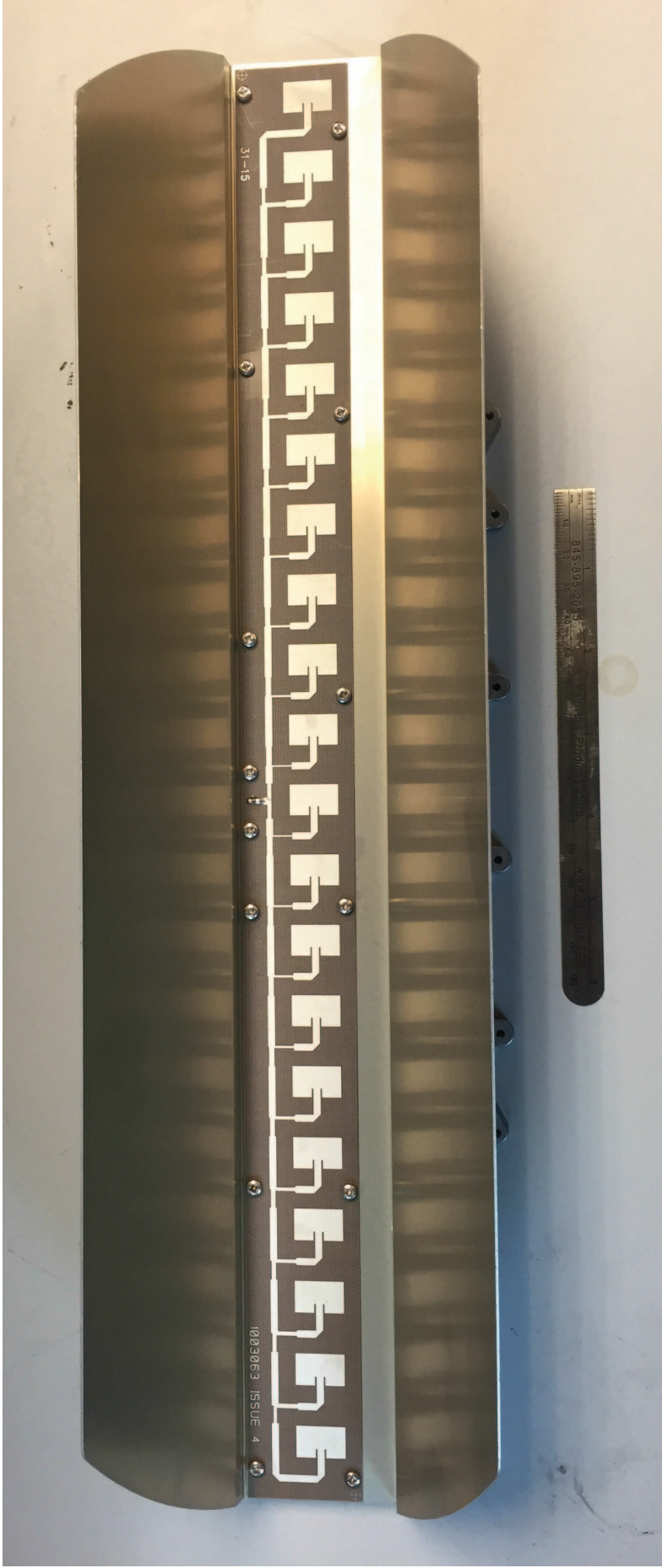
Figure 11 - Antenna