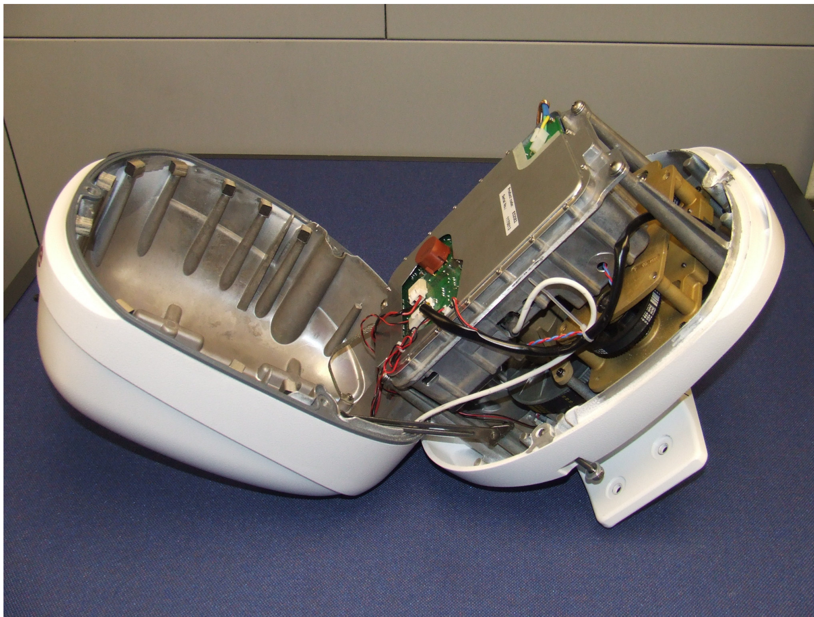
NGS 12kW Digital Open Array Radar Scanner - right-hand view - opened to service position