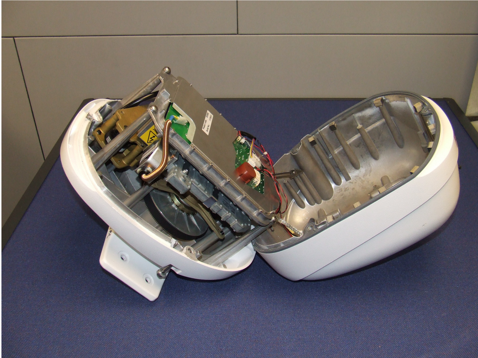
NGS 12kW Digital Open Array Radar Scanner - left-hand view - opened to service position