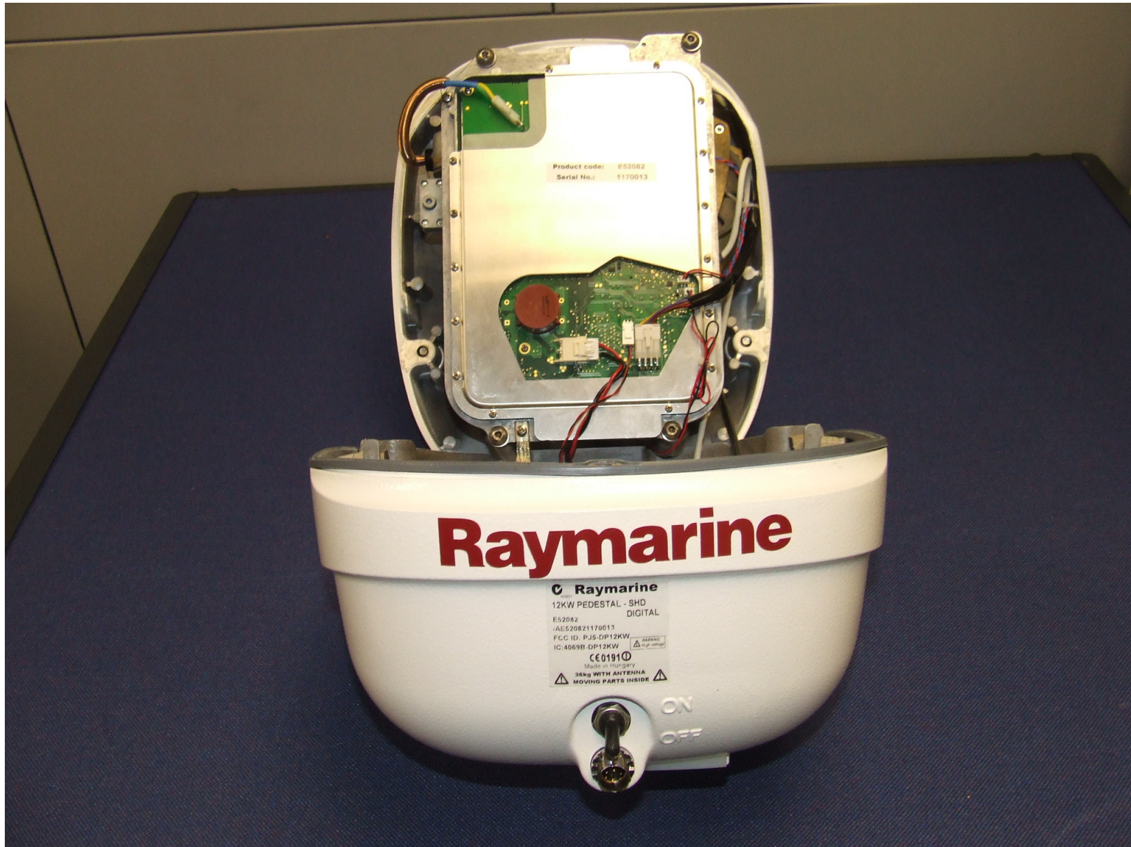
NGS 12kW Digital Open Array Radar Scanner - rear view - opened to service position