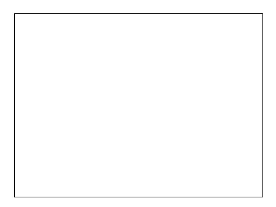
Duty Cycle 3

Ø Delta 1 [T1 ] 0.76 dB RBW 10 MHz *VBW 10 MHz 97 dBµV/m • Att 0 dB SWT 10 ms 440.000000 µs Ref 1 [T1 ] 83.91 dBµV/m Marker 4.420000 ms A SGL 1 AP CLRWR 70 DF 60 DB Шr 100 Center 49.86 MHz 1 ms/