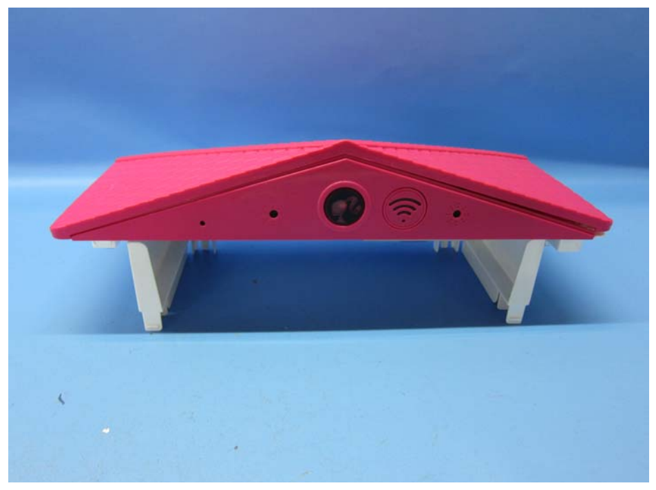
Figure 3 – Front view (Roof Unit)