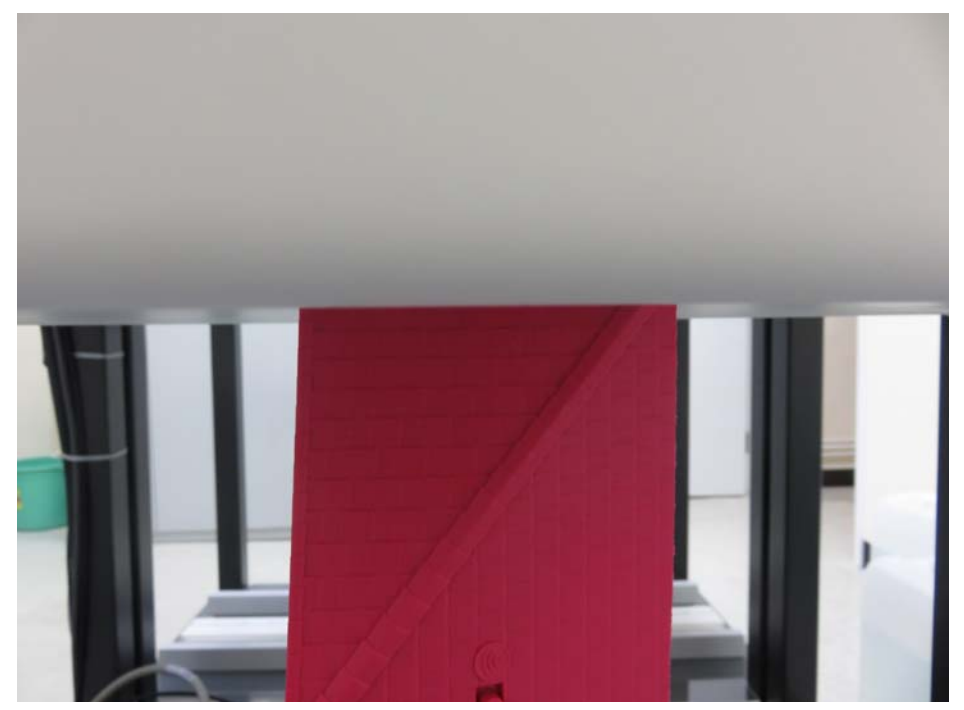
Figure 7 – Test configuration: Left 0mm