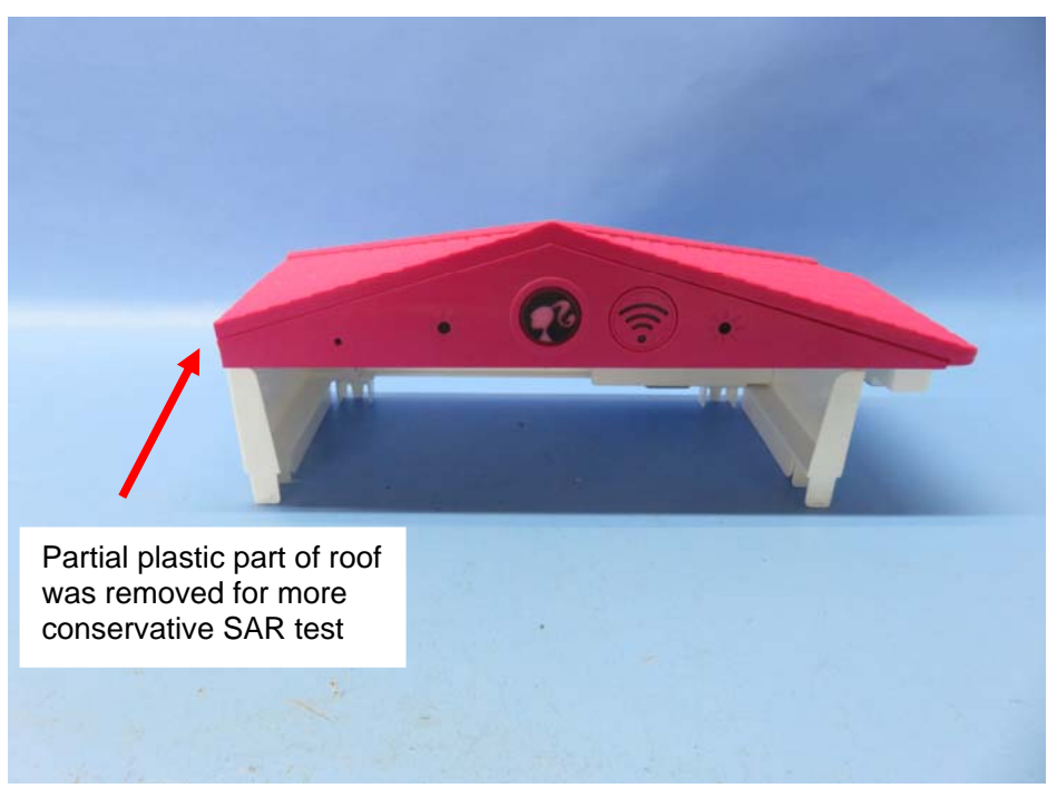
Figure 4 – Modified Front view (Roof Unit)