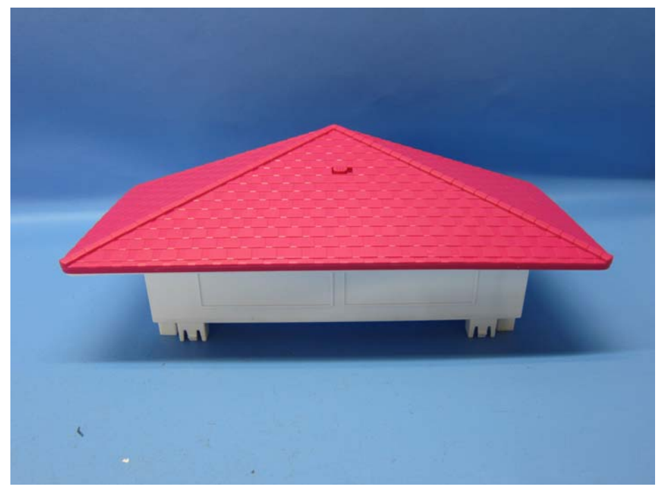
Figure 5 – Back view (Roof Unit)