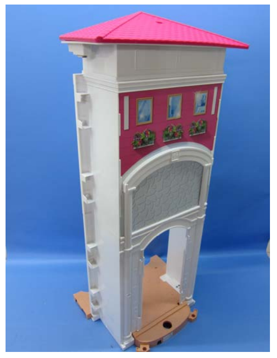
Figure 2 - Back view