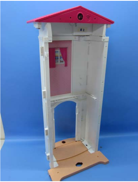
Figure 1 - Front view