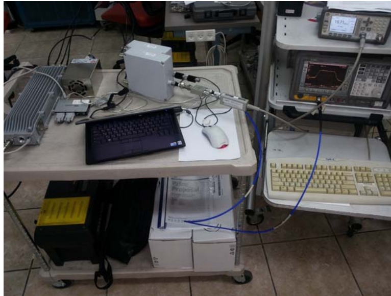
Photograph No.1 Peak output power measurement setup