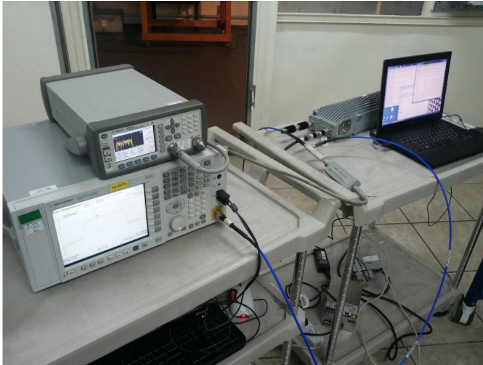
Photograph No.1 Peak output power, OBW, emission mask measurement setup