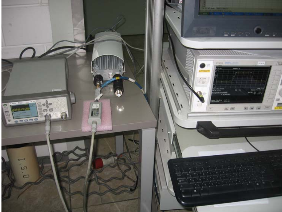
Photograph No.1 Peak output power measurement setup