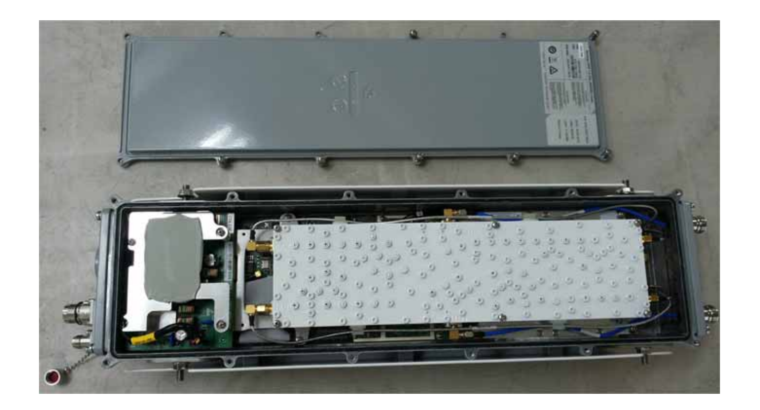
Photograph No.1 "Synergy 2000 1.9 GHz (B2, B25)" base station internal view