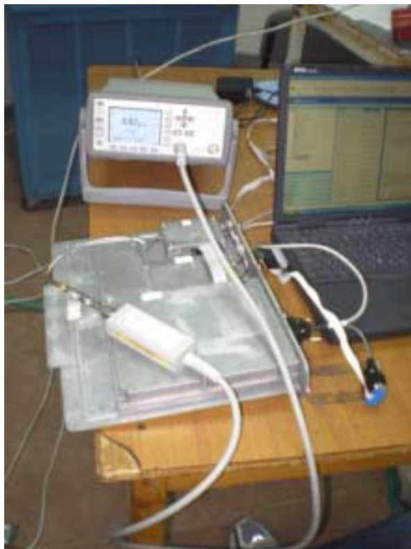
Photograph No.1 Peak output power, power spectral density, conducted spurious emissions measurement setup