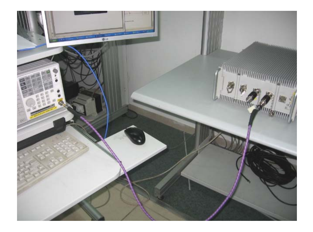
Photograph No.1 Peak output power and occupied bandwidth measurement setup