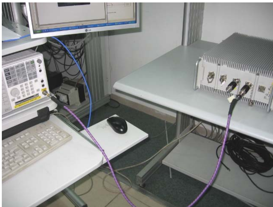
Photograph No.1 Peak output power and occupied bandwidth measurement setup