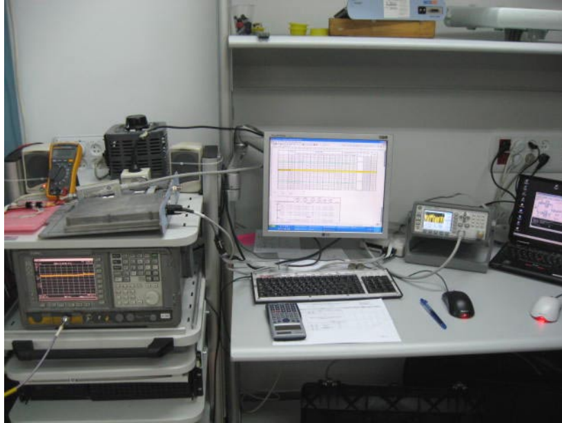
Photograph No.1 Peak output power, occupied bandwidth and conducted spurious emissions measurement setup