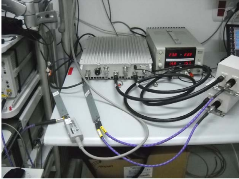
Photograph No.1 Peak output power, emission mask and conducted spurious emissions measurement setup