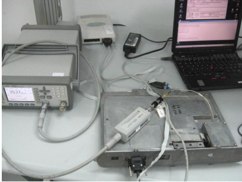
Photograph No.1 Peak output power measurement setup