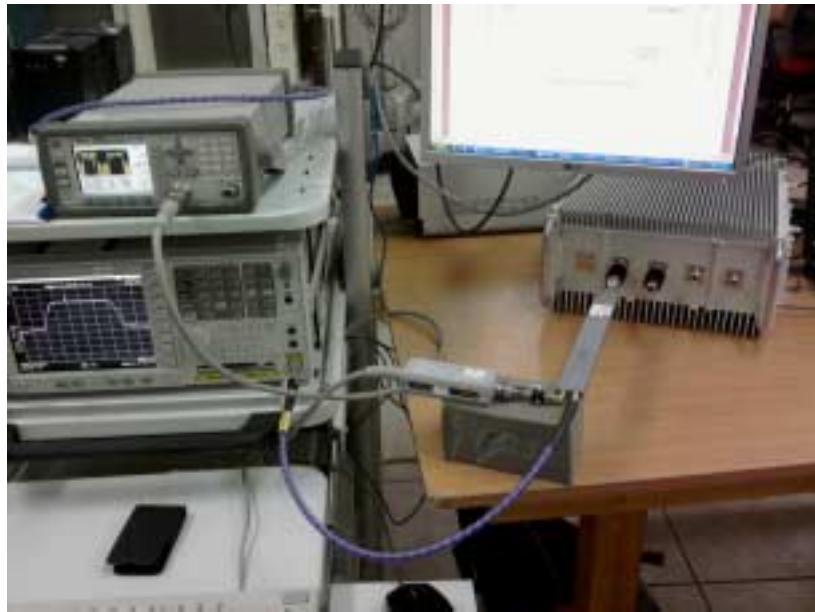
Photograph No.1 Peak output power measurement setup