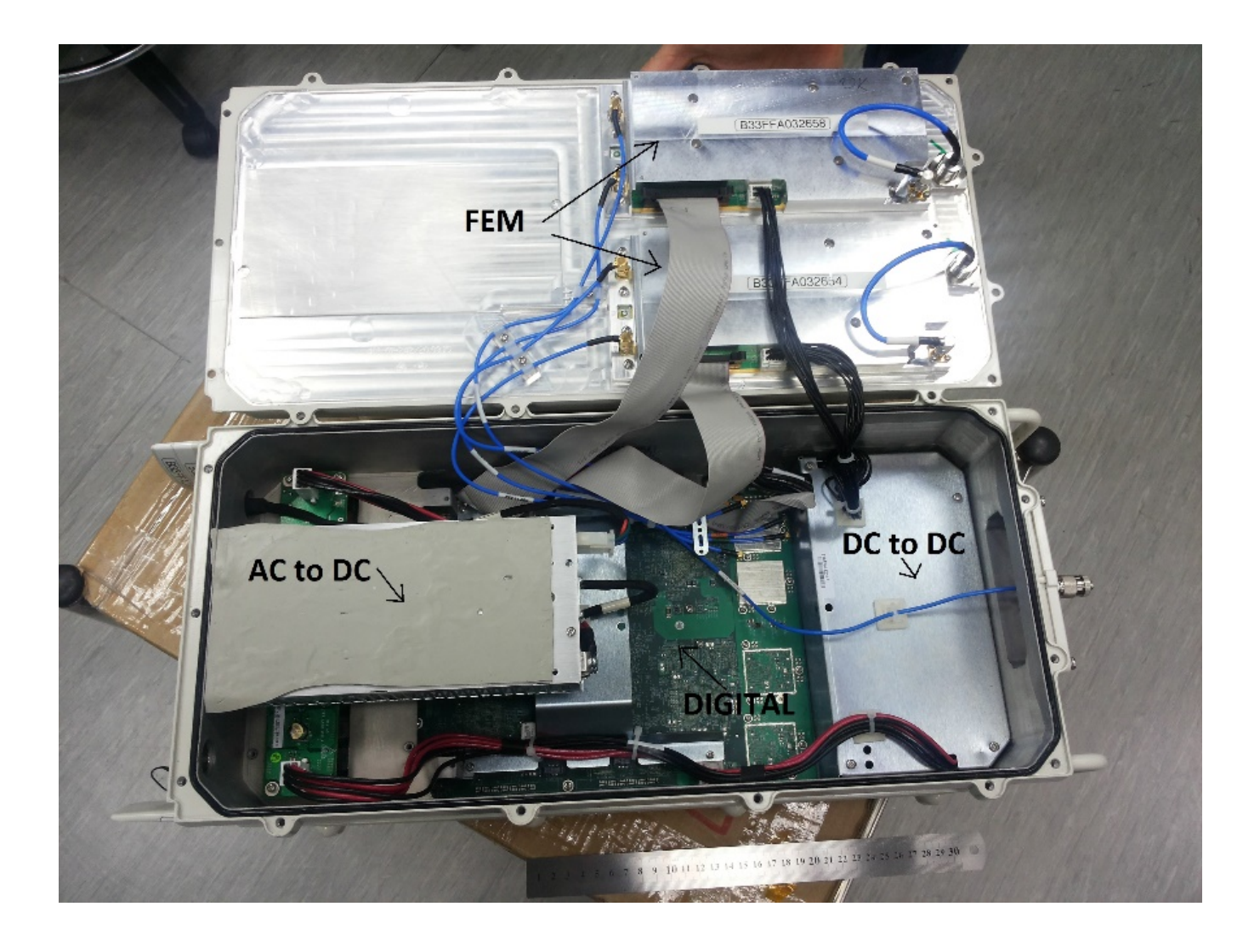
Photograph No.1 "AirHarmony 4400 2.5 GHz (B41)" base station internal view