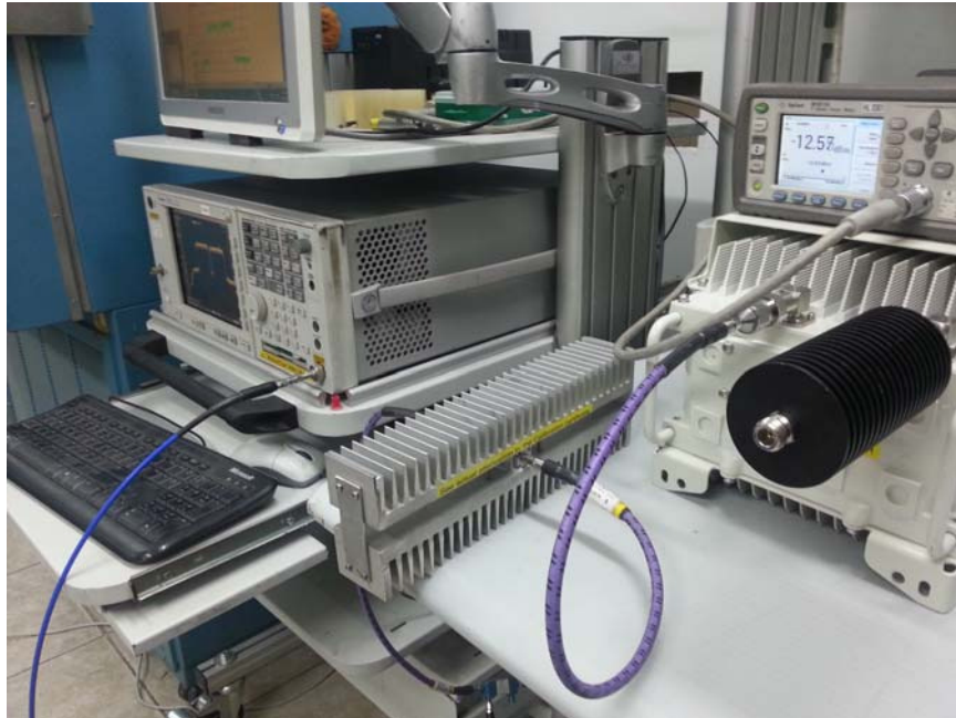
Photograph No.1 Peak output power measurement setup