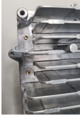
Photograph No.1 Front view