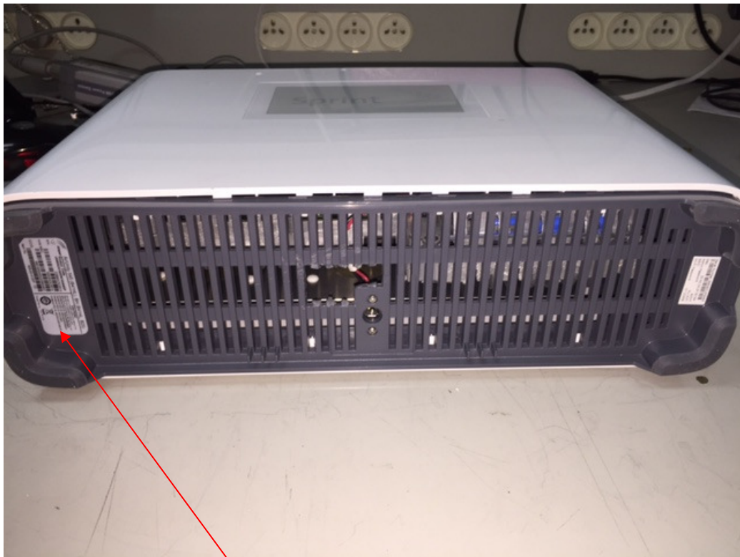
“AirUnity 545 eNB 2.5 GHz (B41)” bottom panel, label with FCC ID:PIDAU545ENB25 location