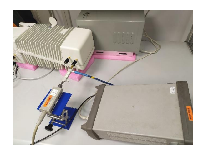
Photograph No.1 Peak output power and power spectral density measurement setup