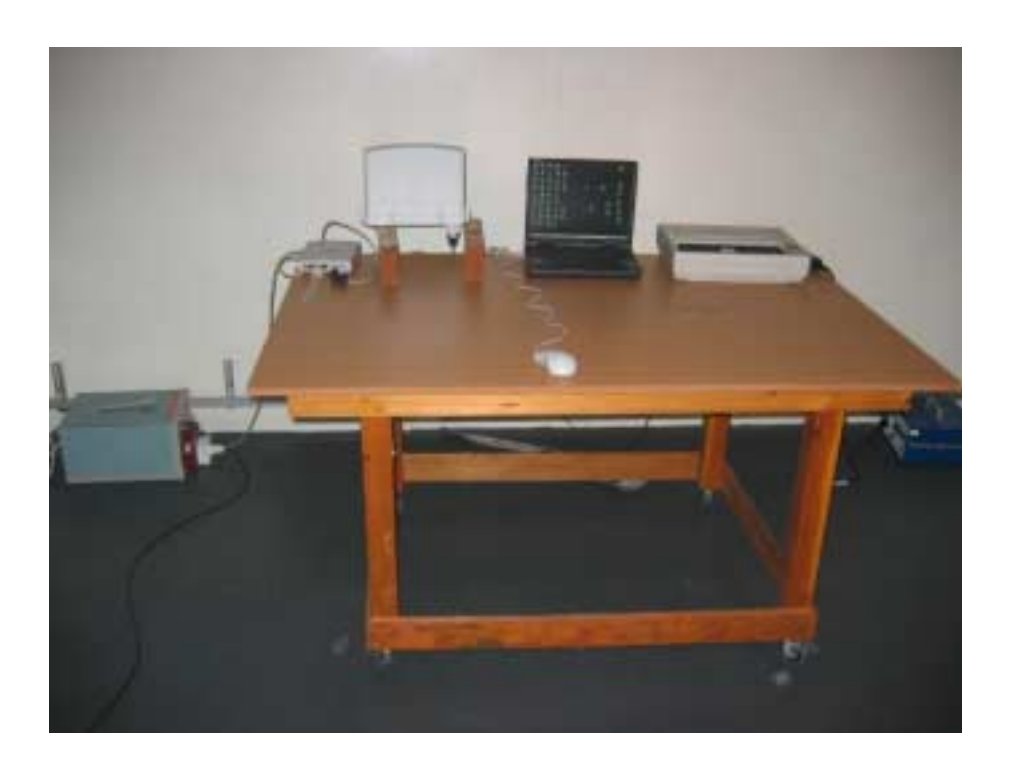
Photograph No.7 Conducted emissions measurement setup on AC line