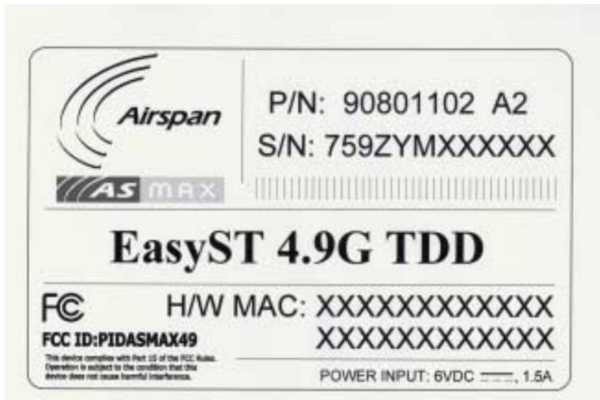
EasyST 4.9 GHz TDD bottom, label with FCC ID:PIDASMAX49 location

The labels shown below are affixed on the bottom of the EasyST and side panel of ProST radio units as shown below. The label material is PVC with a permanent adhesive.