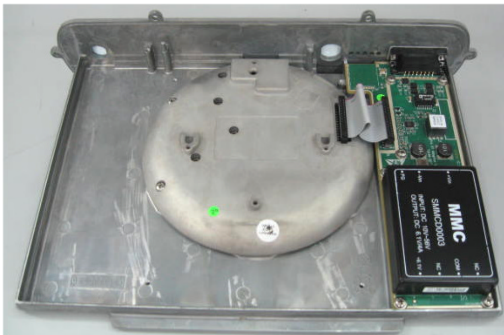
Photograph No.1 "ProST 3.65G TDD" internal view