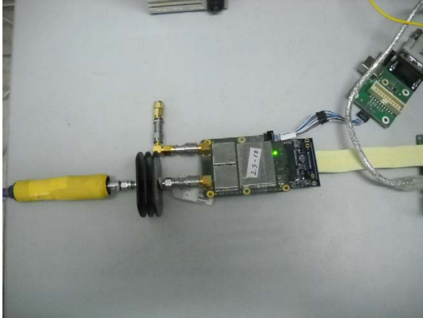
Photograph No.1 Peak output power, emission mask and conducted spurious emissions measurement setup