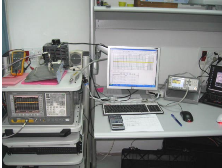
Photograph No.1 Peak output power, occupied bandwidth and conducted spurious emissions measurement setup