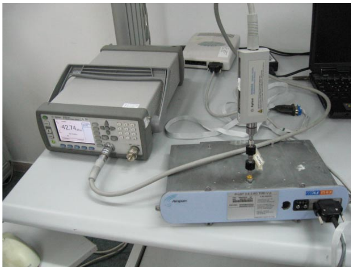
Photograph No.1 Peak output power measurement setup