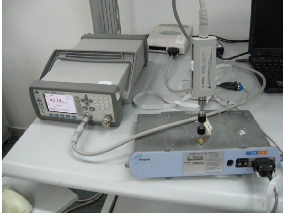
Photograph No.1 Peak output power measurement setup