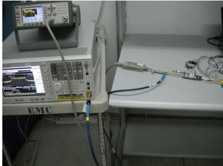
Photograph No.2 Peak output power measurement setup, EUT close view