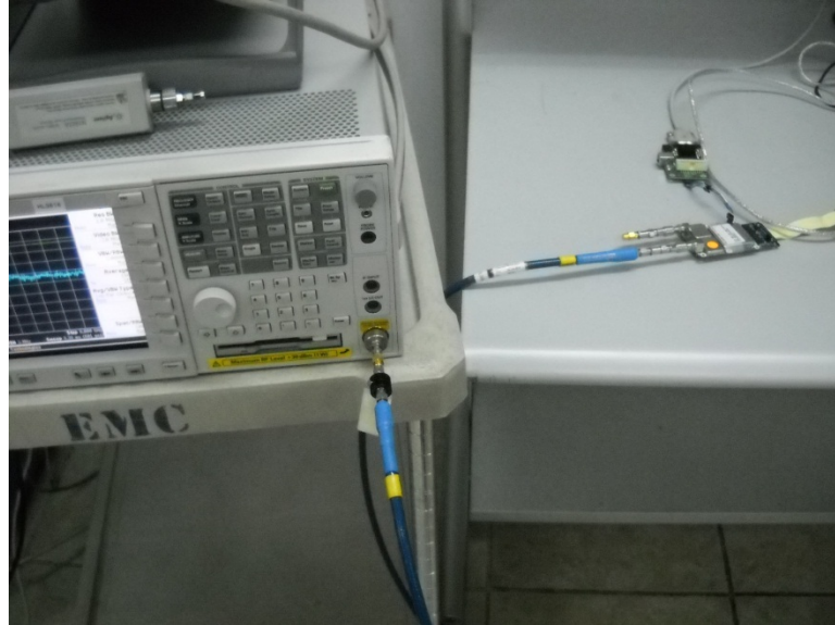
Photograph No.4 Occupied bandwidth and conducted spurious emissions measurement setup, EUT close view