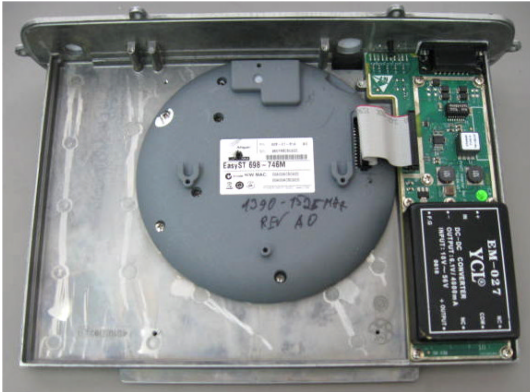
Photograph No.1 "ProST 1.4G TDD" internal view