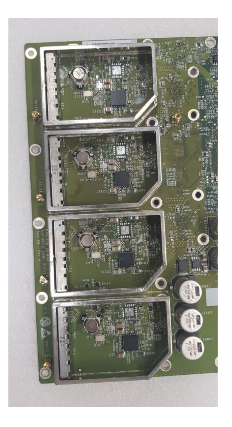
Photograph No.2 Main board close view with shields removed