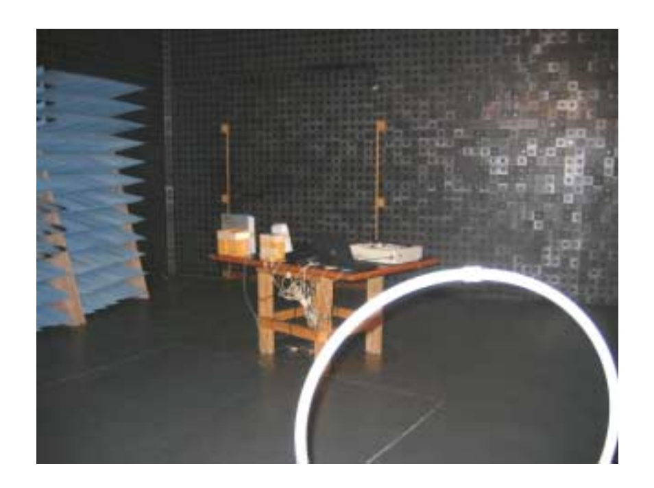
Photograph No.1 Spurious emissions measurement setup in the anechoic chamber below 30 MHz, EUT with panel antenna