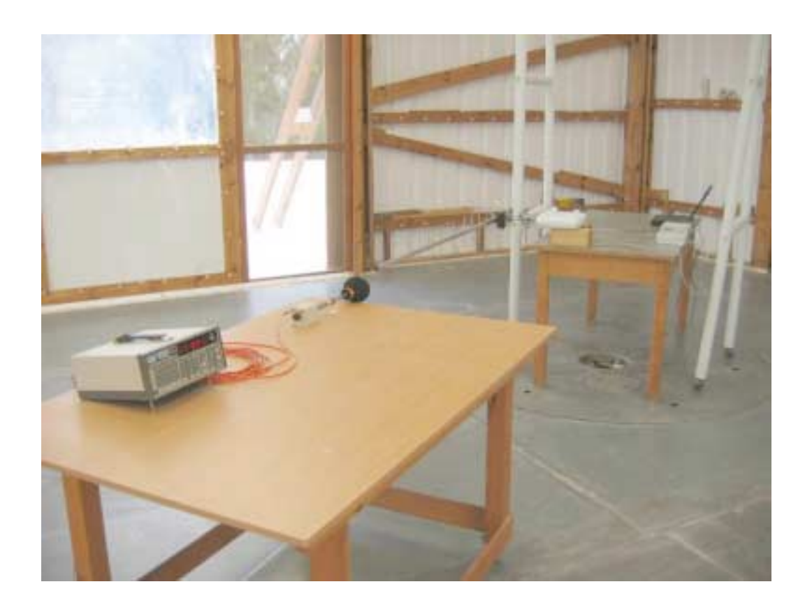
Photograph No.1 MPE measurement setup at the OATS (SPR with YAGI UF-14C antenna, 15 dBi gain)