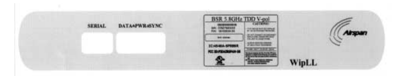
"BSR 5.8GHz TDD V-pol" bottom, label with FCC ID:PIDAIRSPAN-58 location