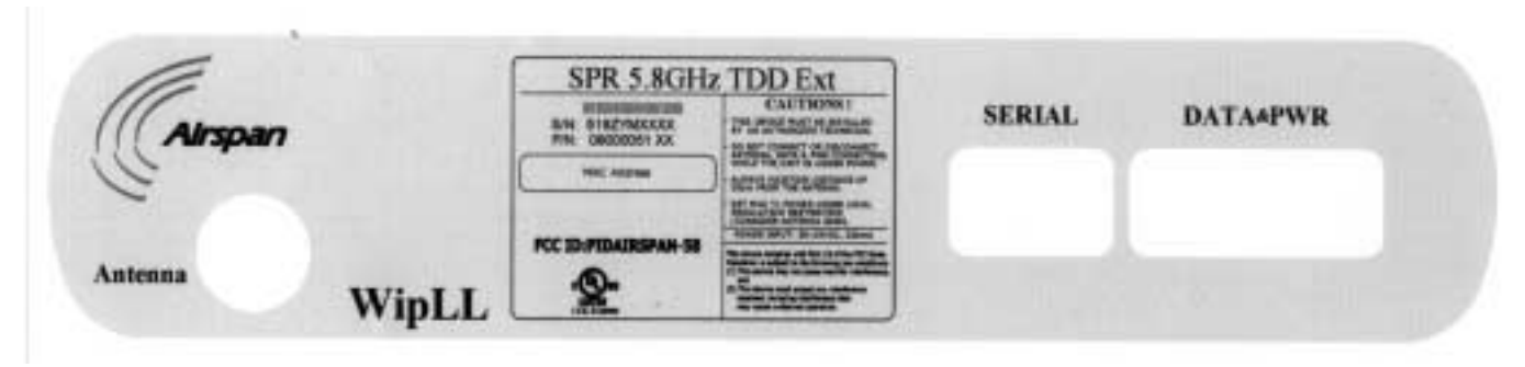
"SPR 5.8GHz TDD Ext" bottom, label with FCC ID:PIDAIRSPAN-58 location