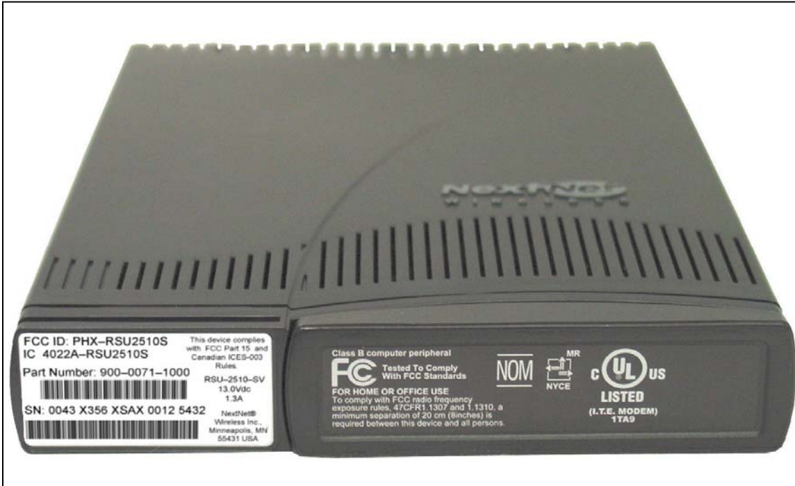
Photograph Showing Label Location On Product