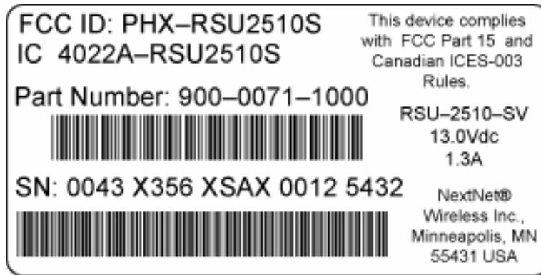
RSU-2510-S Label Example (Vertically Polarized Antenna Model)

The following FCC / Industry Canada tamper resistant label will be attached to the RSU-2510-S product with a permanent adhesive.