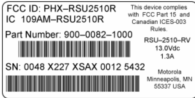
RSU-2510-R Label Example (Vertically Polarized Antenna Model)

The following FCC tamper resistant label will be attached to the RSU-2510-R product with a permanent adhesive.