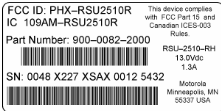
RSU-2510-R Label Example (Horizontally Polarized Antenna Model)