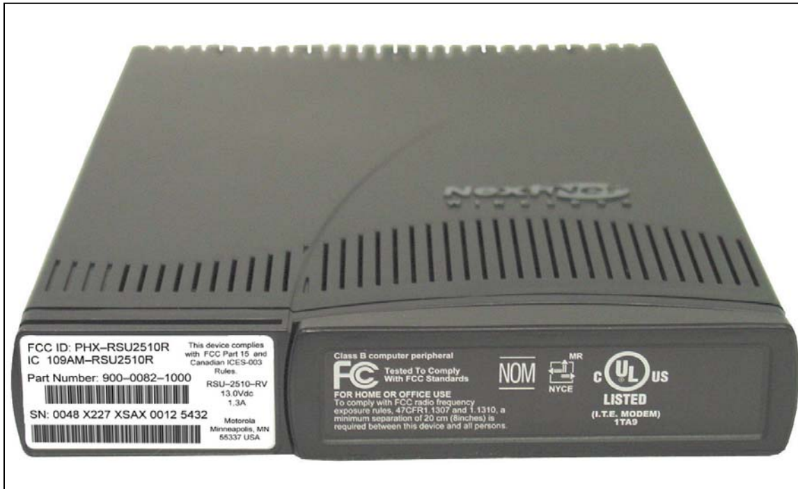
Photograph Showing Label Location On Product