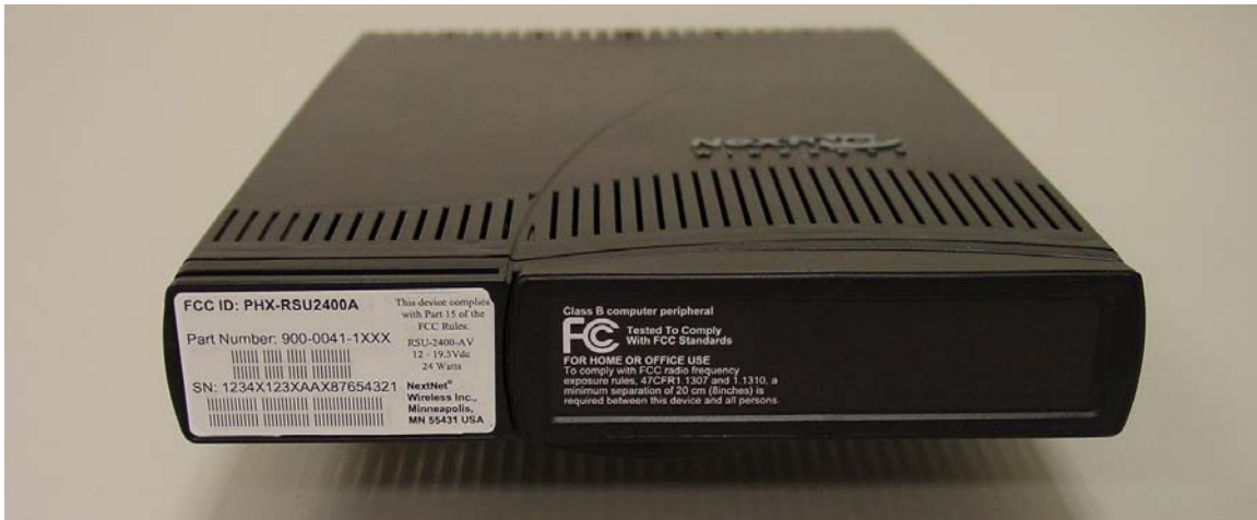
Photograph showing label location product