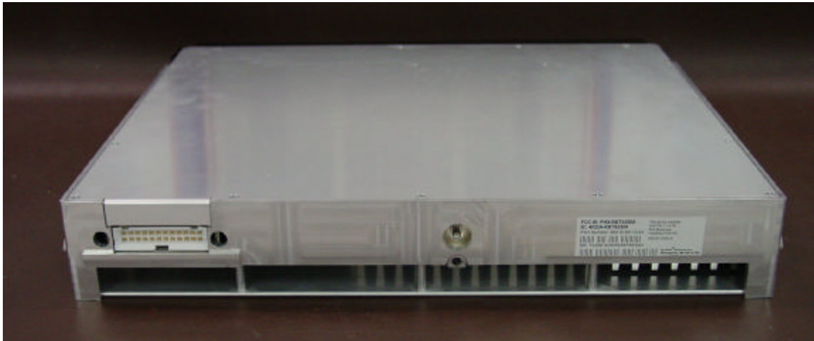
Photo showing label location on base unit