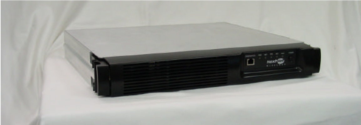
Front view (transceiver)