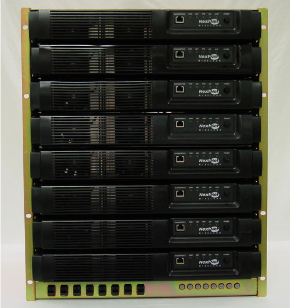
Chassis front view (2 watt and 5 watt)