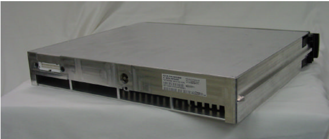
Back view (transceiver)