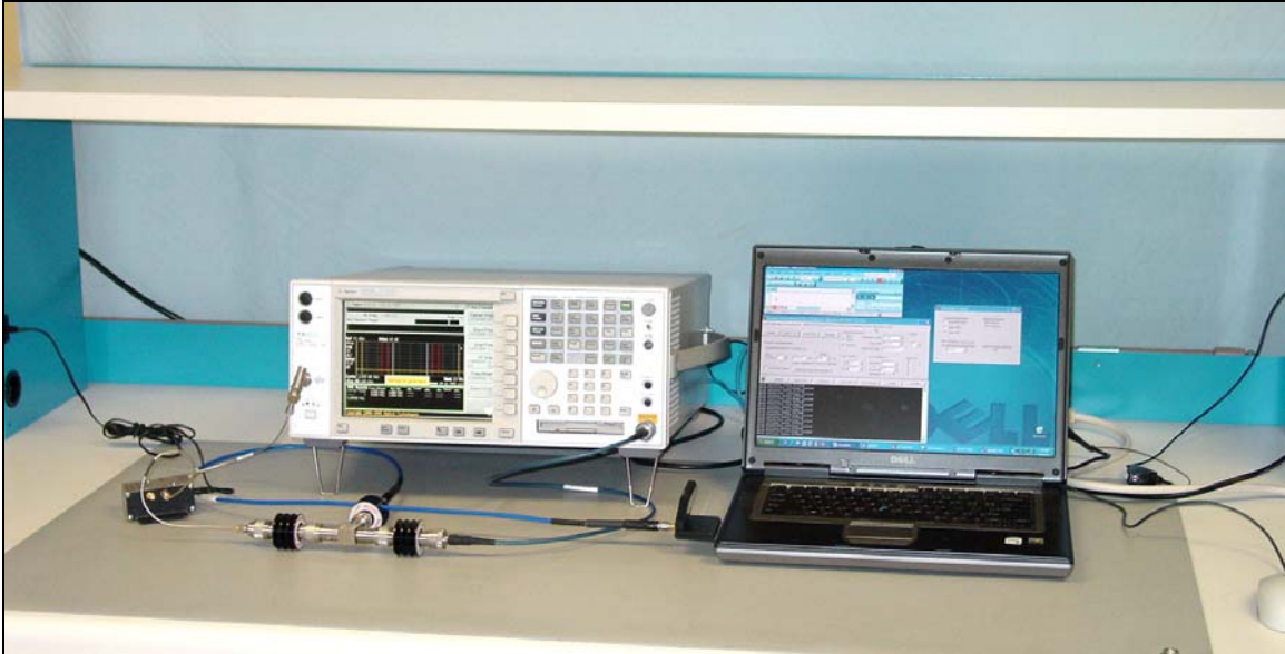
General Test Bench Setup