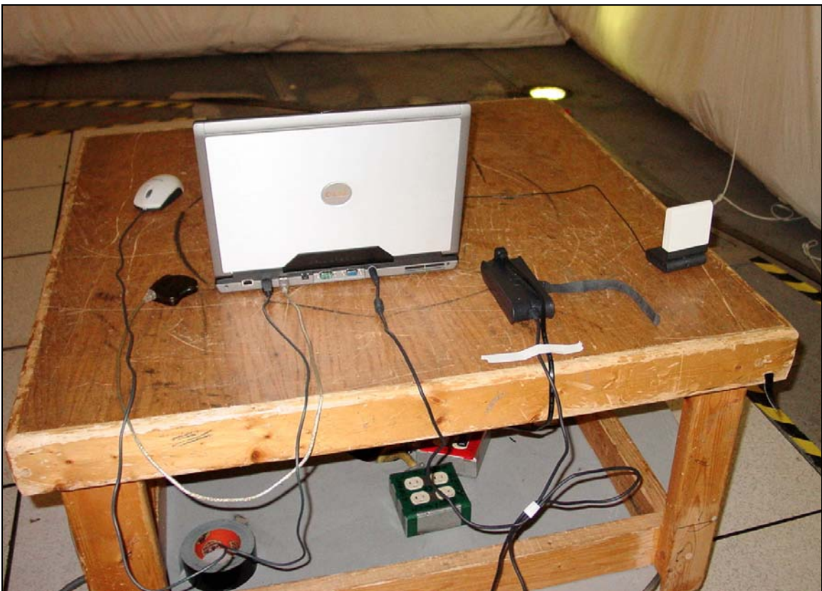
Field Strength of Spurious Radiation (View 2)