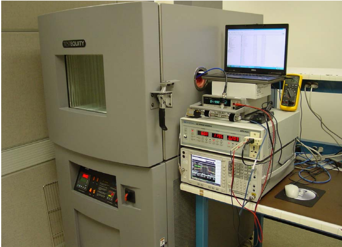
Frequency Stability Test Setup