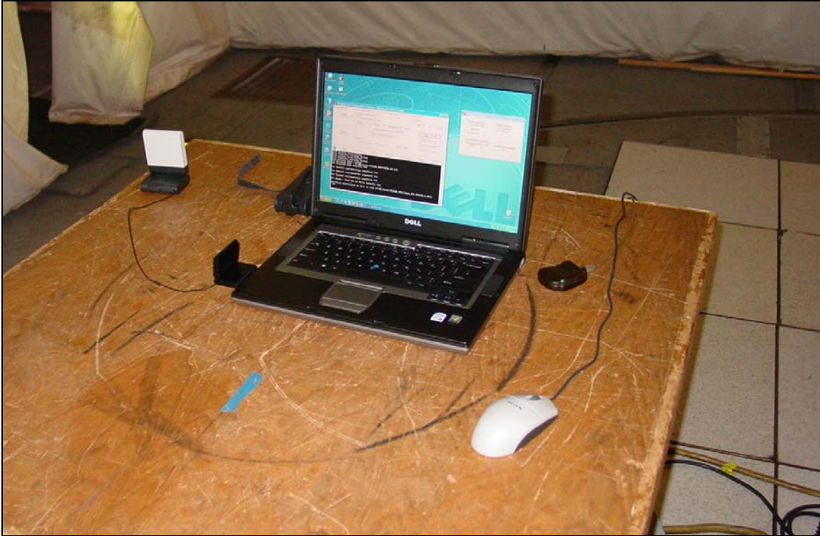
Field Strength of Spurious Radiation (View 1)