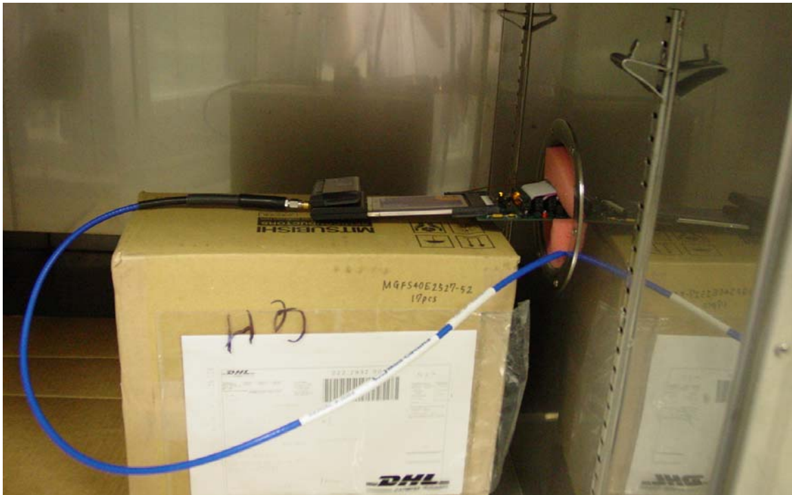
Frequency Stability Test Setup (Inside Chamber)