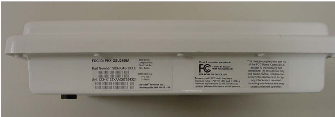
Photograph showing label location product