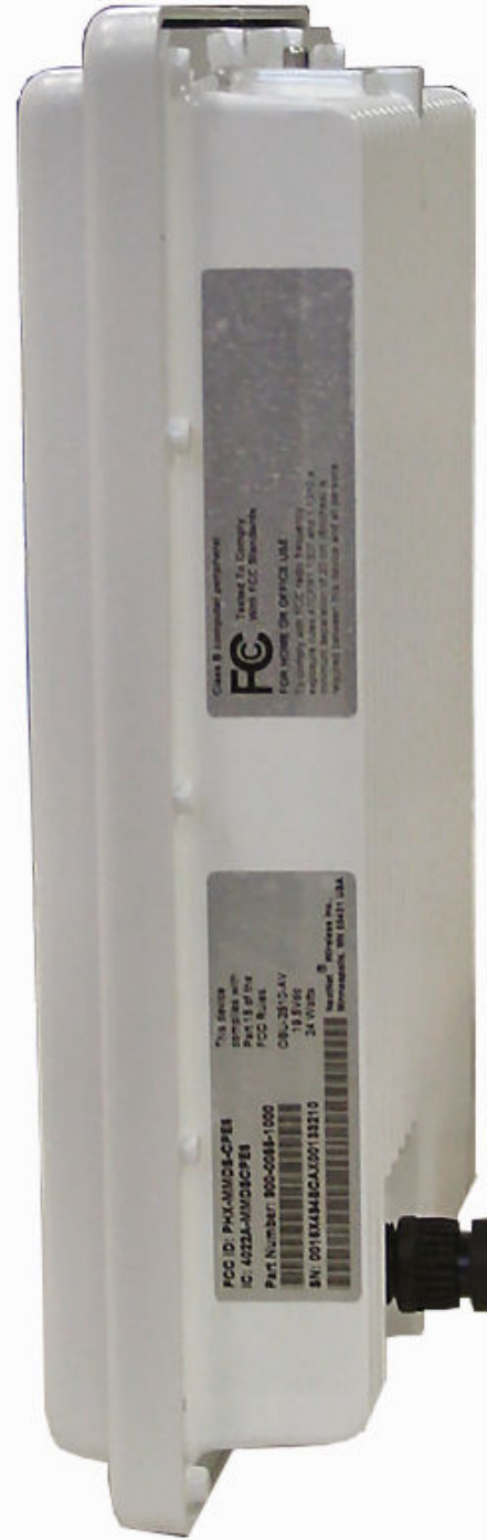
Unit With Original Label