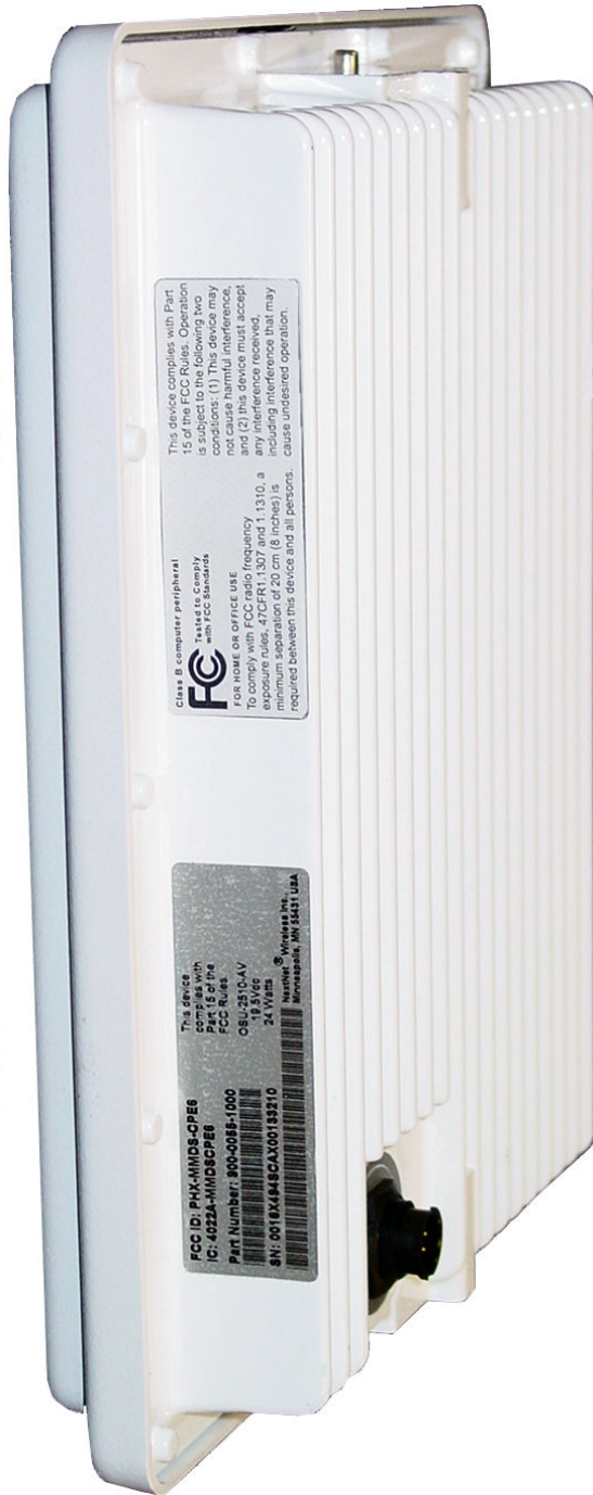
Unit With Requested Label Layout