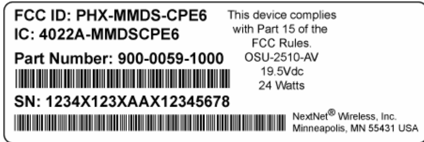
OSU-2510-AV Label (with vertically polarized antenna)