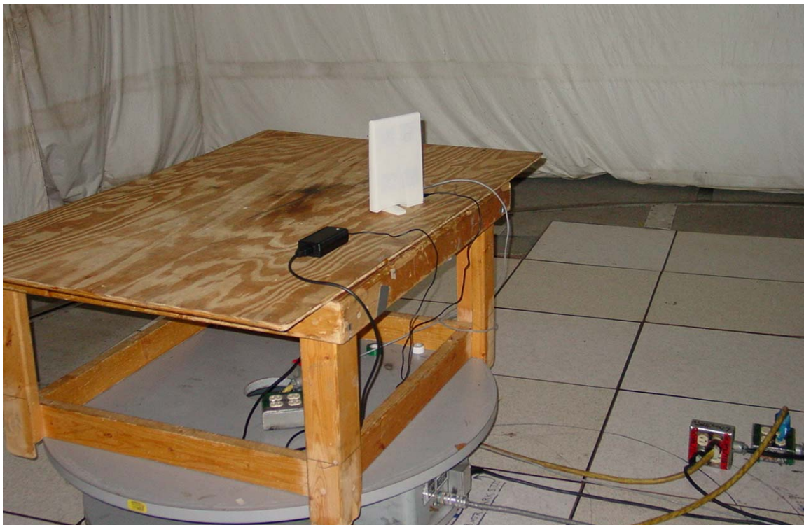
Field strength of spurious radiation