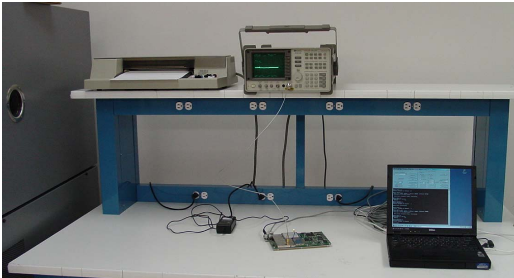
Spurious emissions at antenna terminals