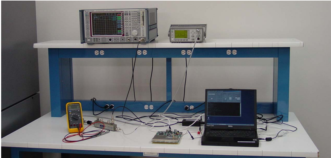
RF Power Out, Modulation Characteristics, Occupied Bandwidth