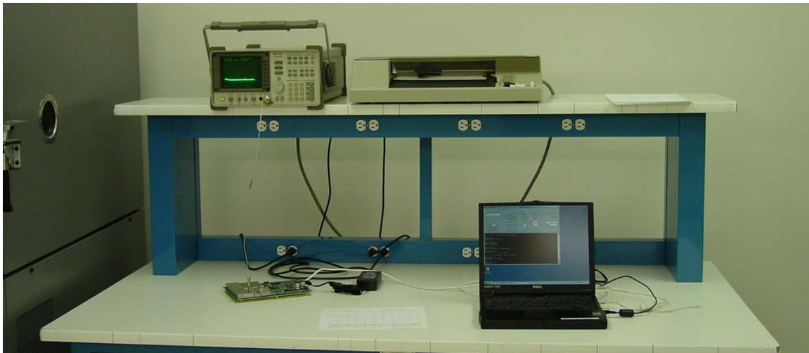
Spurious emissions at antenna terminals