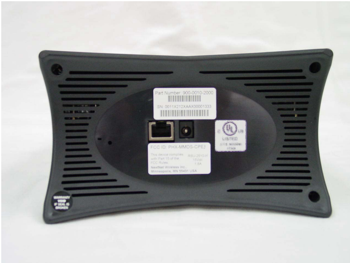
Photo showing label location on indoor CPE unit