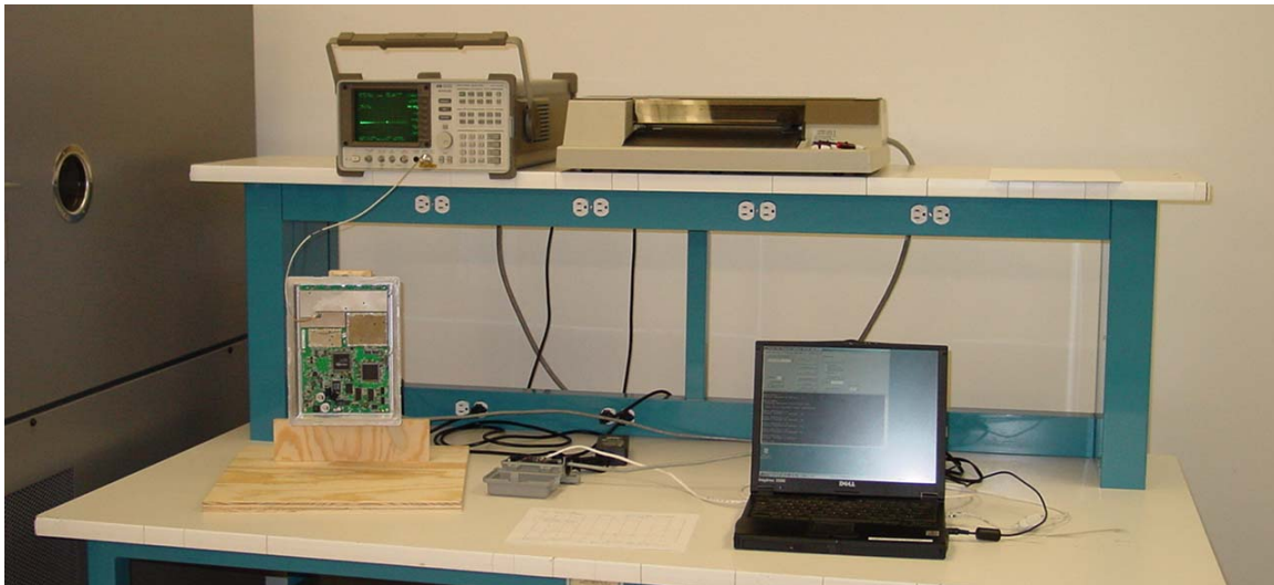
Spurious emissions at antenna terminals