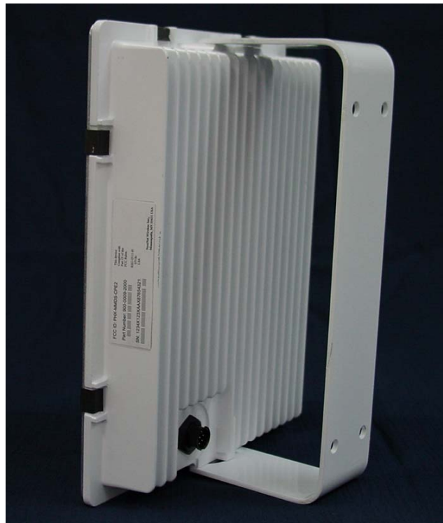
Photo showing label location on external CPE unit