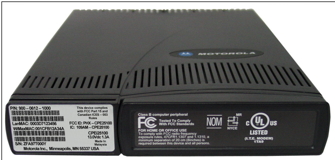
Photograph Showing Label Locations On Product