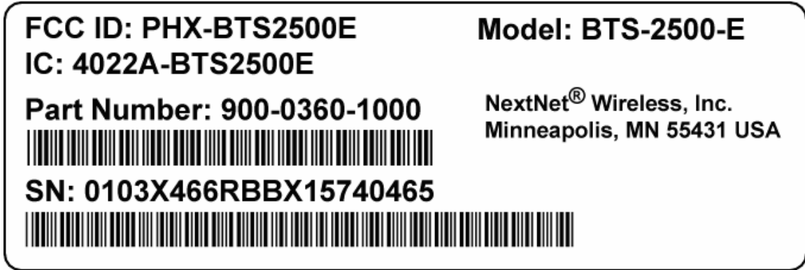
ID Label Example

The following FCC / Industry Canada tamper resistant labels will be attached to the BTS-2500-E product with a permanent adhesive.