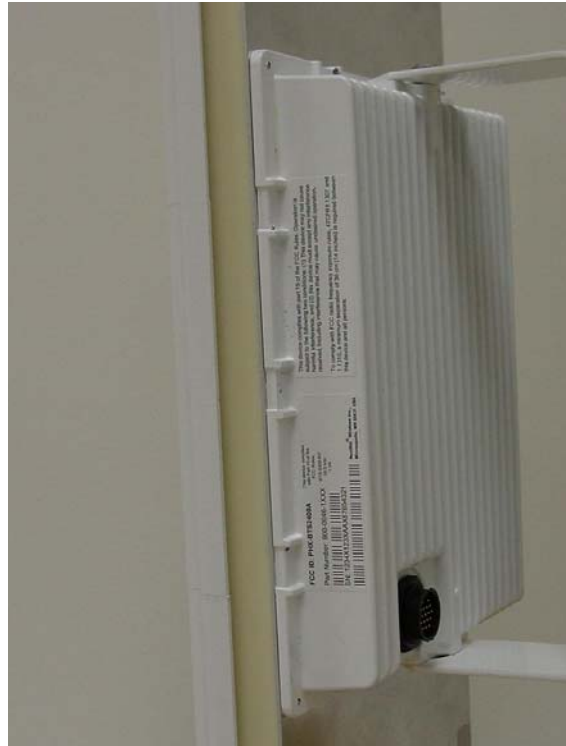
Photo showing label location on BTS-2400-AV base station product